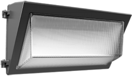
Color: Bronze Weight: 11.5 lbs