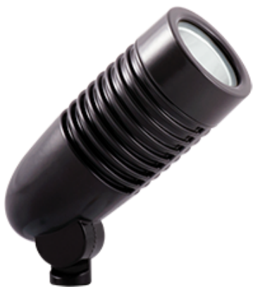
Same small package. Bigger output. Replaces 50W MR16 Floodlight. Color: Bronze Weight: 1.6 lbs